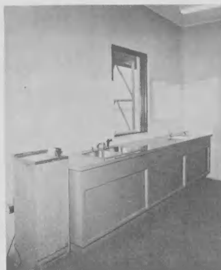
One area of the Lunch Room is provided with drinking and washing facilities.

Renovation of the Finger Pier Lunch Shelter is part of Lago's continuing efforts to improve working environment. Smaller facilities, some of them in combination with offices, are located in the various refinery areas. Where necessary — due to environmental problems, these shelters have been airconditioned. In addition to these permanent facilities, a mobile shelter is stationed wherever there is a high concentration of